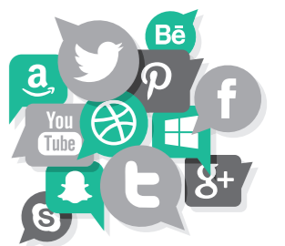
SNS 营销 SNS MARKETING