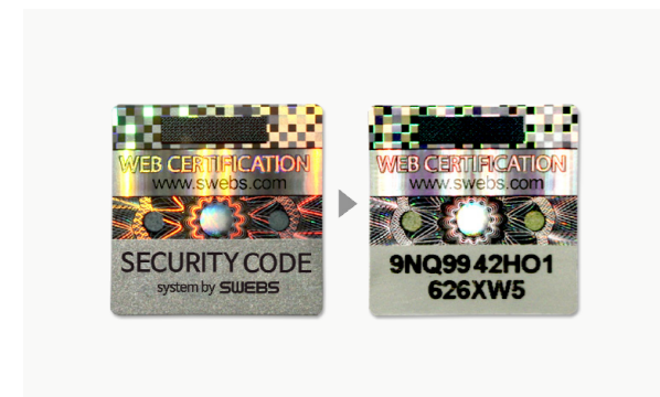
输防伪编码(PIN) INPUT PIN

SWEBS is an Initial of Security WEB certification System. SWEBS is a total solution for Genuine Certification Service, Various Marketing and CRM etc. SWEBS is created by combination of a differentiated optical technology and powerful online security system. SWEBS is perfect system to protect your valuable customers and brand from illegal fake items.