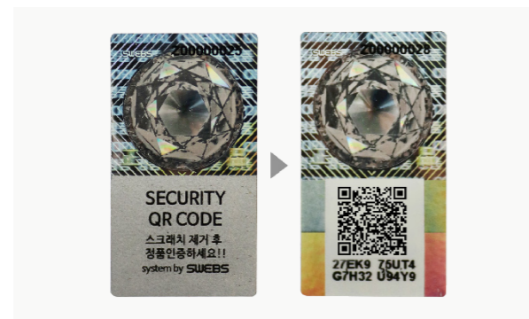
扫描二维码 SCAN QR CODE