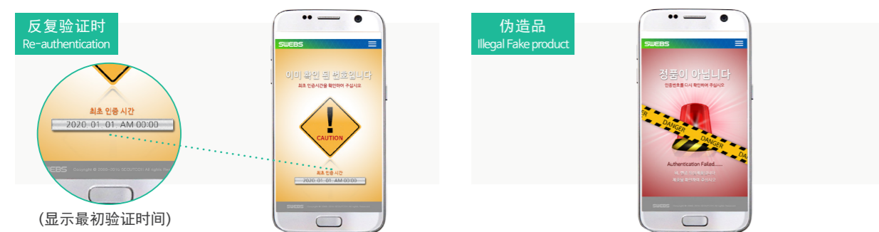
反复验证时 Re-authentication (显示最初验证时间) (Inform The First Certified Date and Time)

SWEBS QR code is created by self-developed encryption program, so it's impossible to be copied. Furthermore, if certified code is certified again, program inform "It's already used code" with "The First Certified Date and Time" to protect reuse of code.