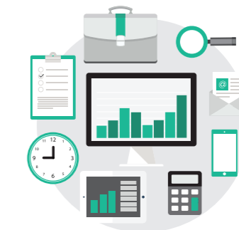
提供营销要素 PROVIDE MARKETING DATA