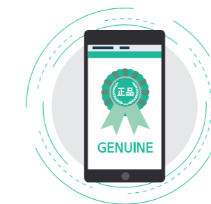
提供正品验证 GENUINE CERTIFICATION