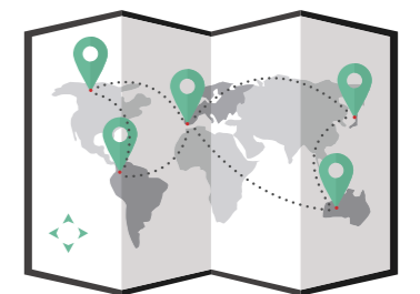
客户管理服务 DISTRIBUTION/ CUSTOMER MANAGEMENT