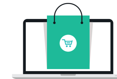
提供内容网页 PROVIDE VARIOUS CONTENTS